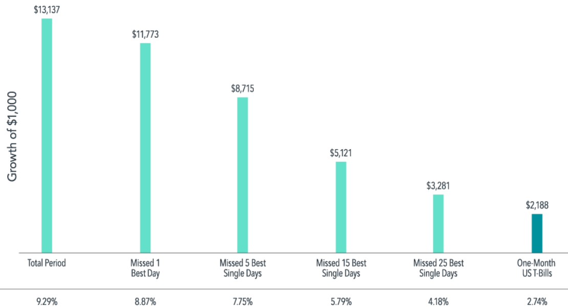
Exhibit 2: Performance of the S&P 500 (1990-2018)

In US dollars. For illustrative purposes. The missed best day(s) examples assume that the hypothetical portfolio fully divested its holdings at the end of the day before the missed best day(s), held cash for the missed best day(s), and reinvested the entire portfolio in the S&P 500 at the end of the missed best day(s). Annualized returns for the missed best day(s) were calculated by substituting actual returns for the missed best day(s) with zero. S&P data © 2019 S&P Dow Jones Indices LLC, a division of S&P Global. All rights reserved. One-Month US T-Bills is the IA SBBI US 30 Day TBILL TR USD, provided by Ibbotson Associates via Morningstar Direct. Source #1.