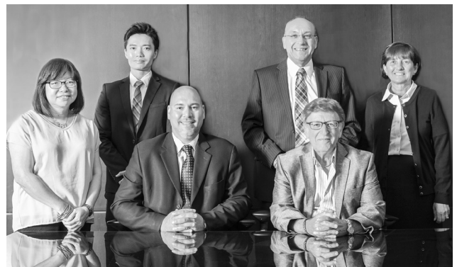
Rabinowitz-Voronoff Financial Group

In this season of resolutions, why not resolve to be aware of the effects that emotions